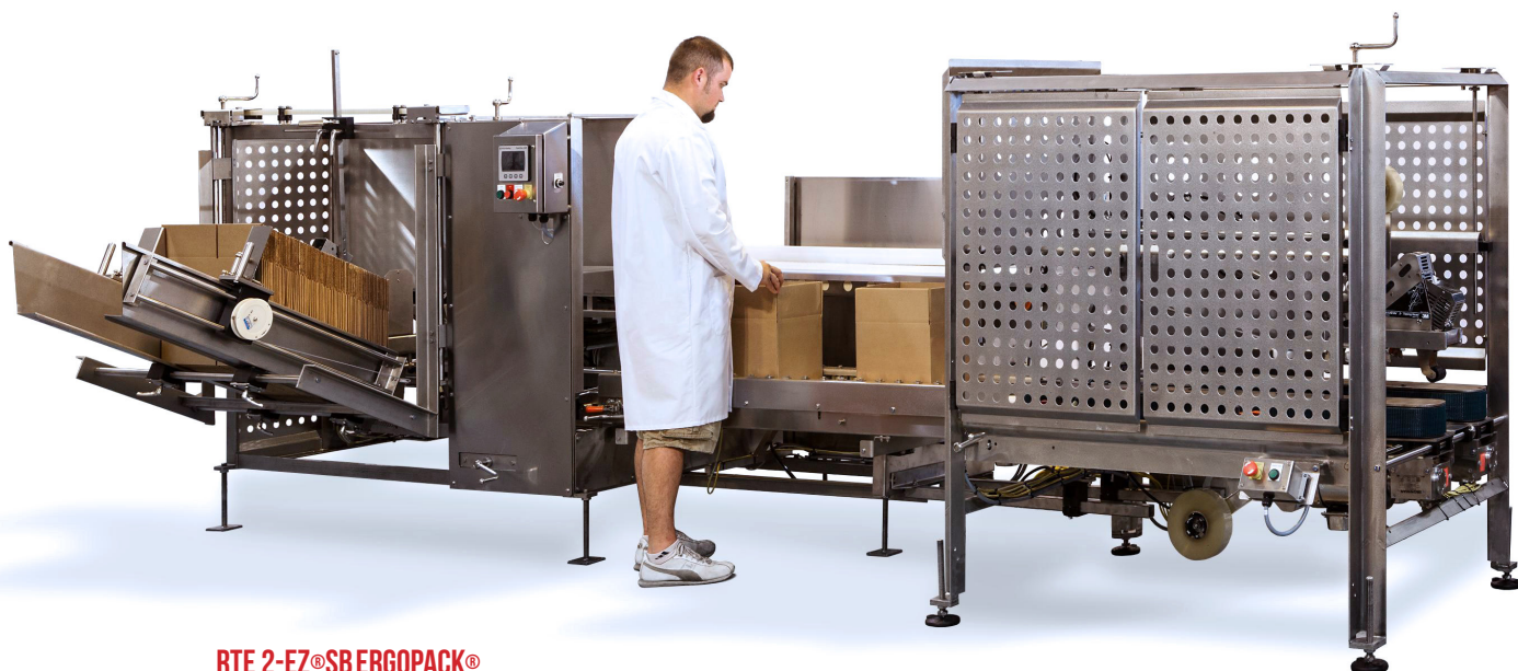
RTE 2-EZ®SB ERGOPACK® Sanitary Hand Packing Station