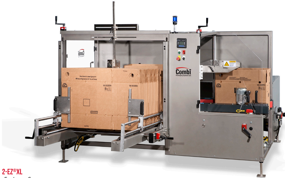
2-EZ ® XL For Large Cases

Combi Packaging System's heavy duty side belt drive case erectors form and bottom seal large and extra large cases at speeds up to 15 cases per minute. These machines are built for optimal durability, reliability and value. Engineered with the industry's strongest frame (lifetime warranty) for the most demanding 3-shift environments, the 2-EZ ® XL, 2-EZ ® XL HS, and 2-EZ ® XXL can readily integrate into your existing line. Combi's user-friendly EZ-load walk-in case magazines and quick changeover system are standard features. These dependable case erectors will provide years of service and can form and seal the widest variety of large cases, from single wall to triple wall corrugated.