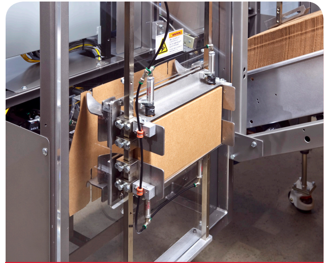
COMBI'S FORMING MANDRELS CREATE TIGHT SQUARE CORNERS

An operator loads flat tray blanks into the magazine. A vacuum arm extends to the tray blank, applies suction, retracts and then moves the flat tray horizontally past two glue heads, which apply a glue bead to the tray tabs. The glue application is controlled by magnetic position sensors which sense the tray position. After passing the glue heads, the transport arm extends and pushes the flat tray blank into a mandrel, forming the tray and folding the tabs. At this moment, four small cylinders extend into the mandrel, one at each corner of the newly formed tray, applying pressure and securing the glue seal. The vacuum arm then retracts and returns to the home position to pull another blank.