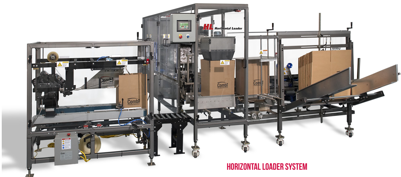
HORIZONTAL LOADER SYSTEM