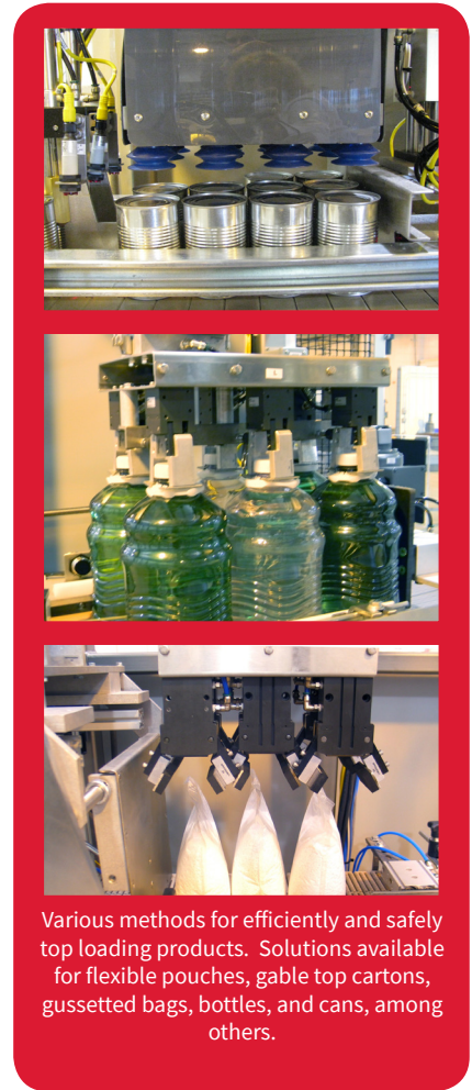
Various methods for efficiently and safely top loading products. Solutions available for flexible pouches, gable top cartons, gusseted bags, bottles, and cans, among others.

* Speeds are dependent on case, product and pack pattern